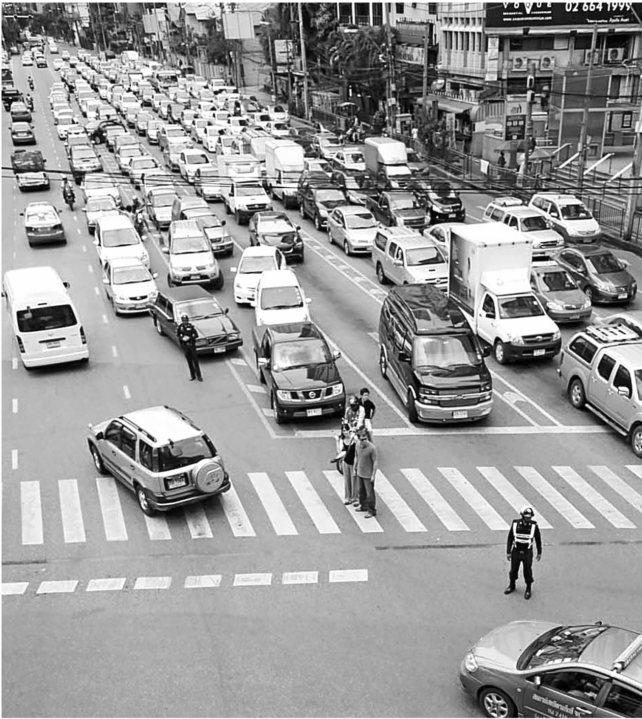
Congestion clogs Asok Road in the Sukhumvit area. The BMA's plan to build an elevated highway to cover the road has been challenged by locals who believe the new structure is useless and will add to pollution. PATIPAT JANTHONG

Ploenpote Atthakor is Deputy Editorial Pages Editor, Bangkok Post.