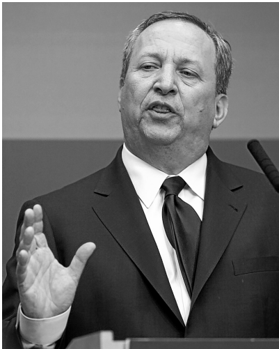
Larry Summers

scores only 1.5 out of 3 on those criteria. Janet Yellen, the current vice chair of the Fed, would be close to 3 out of 3 on anybody's book. She has no temperamental issues. Of course, that does not keep those who implicitly raise the “woman issue” from doing their level best to insert that age-old stereotype across into the equation. And yet, if anybody is given to mood swings, it's Mr Summers — not Ms Yellen. That critical scoring may still not be enough for Ms Yellen to get the nod, given the determination of President Obama's team of guys to push him through. Mr Summers is also said to have the “respect” of the financial markets. More likely, he has their backs — which is not what the American people need. Alan Greenspan, of course, did not just have the “respect” of the financial markets. They adored him. The disastrous results for the global economy and the US's middle class are now well known. Ultimately, the trouble with Larry Summers is two-fold: First, no matter what other people want to tell you about his open-mindedness, he ultimately believes that he does have all the answers. And second: While some of his answers are actually good and on target, he mostly presents those in newspaper comments when he is out of power. That is not just